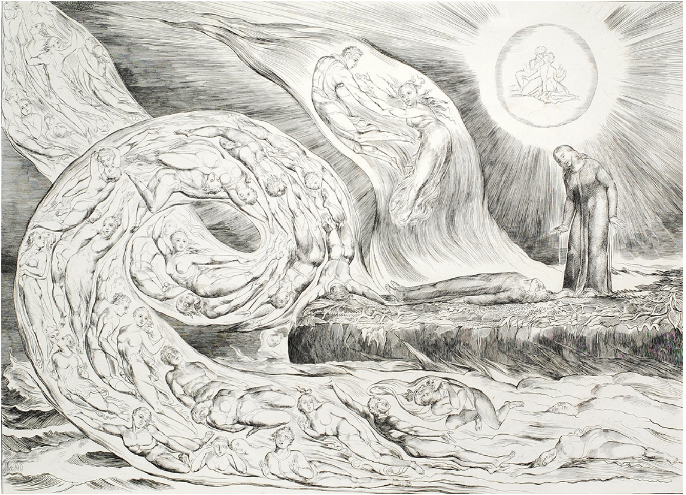
Illustrations to Dante's Inferno . Plate 1: "The Circle of the Lustful: Paolo and Francesca". [London: for John Linnell, 1838]. (all seven plates from Illustrations to Dante's Inferno for sale as a complete set (only one of the series is shown here here). Also known as "The Whirlwind of Lovers," one of Blake's most innovative prints. $350,000 for set of seven plates.