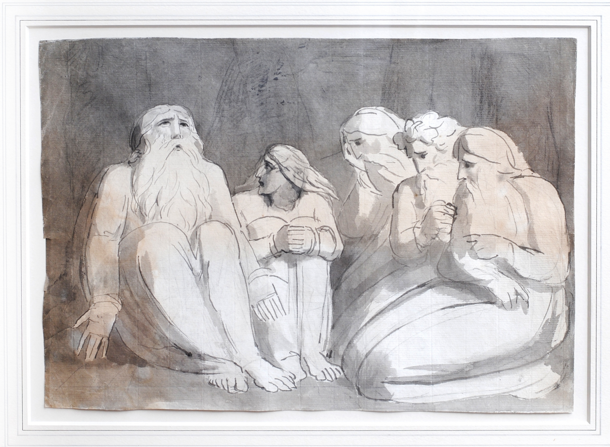
The Complaint of Job c. 1785. This is an important preparatory sketch for the first extant preliminary drawing for the great separate print of Job. Rendered in pen and India ink it was probably executed five to eight years before that engraving. Price on request.